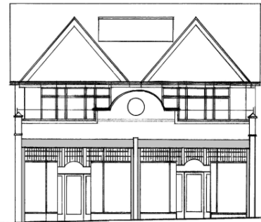
FRONT ELEVATION (ROLLER SHUTTER OPEN)