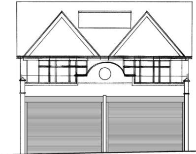
FRONT ELEVATION (ROLLER SHUTTER CLOSED)